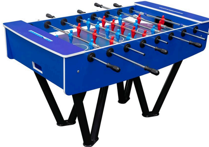
Table football BS-105KB - blue