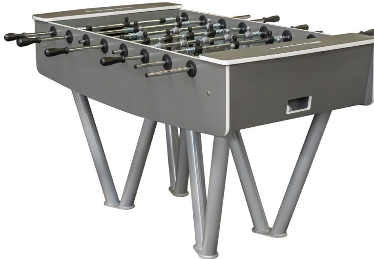
Table football BS-105KS - silver