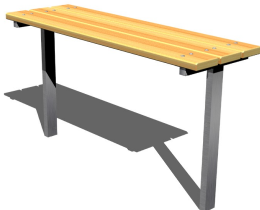
Table for the seating set ST002K